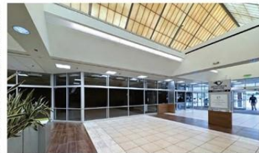
Huntsman Square Shopping Mall leased space, home to future temporary senior center, after remodeling former retail store space, new dark windows.

Springfield District residents are finally seeing action on an active adult community center within their district, the only district not without a dedicated building for active adults. The current work is for a temporary location. A permanent center is likely still close to ten years away, and dependent on possible funding received through a bond referendum in 2026. For the temporary location, the Board of Supervisors approved a five-year lease, with multiple one-year options, within the Huntsman Square Shopping Center, a site not far from the South Run Recreation Center. Fairfax County's Department of Neighborhood and Community Services has conducted a series