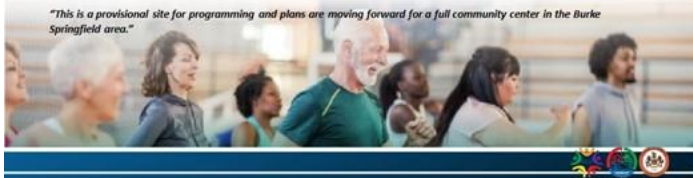
"This is a provisional site for programming and plans are moving forward for a full community center in the Burke Springfield area."